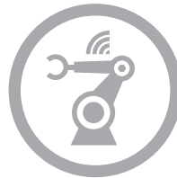
SMART AUTOMOTIVE FACTORY