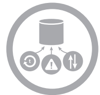
ELECTRONIC DATA RECORDING