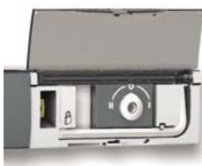
Easy selection of AUTO/ MANUAL mode