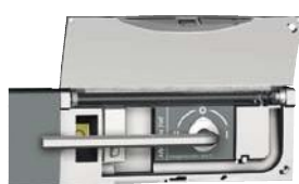
Back-up manual operation