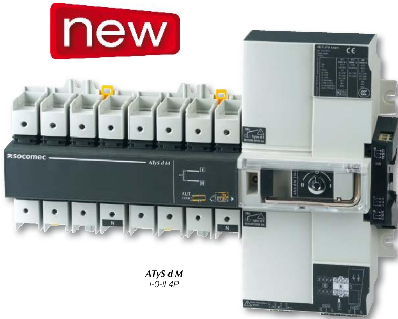
ATyS d M I-O-II 4P